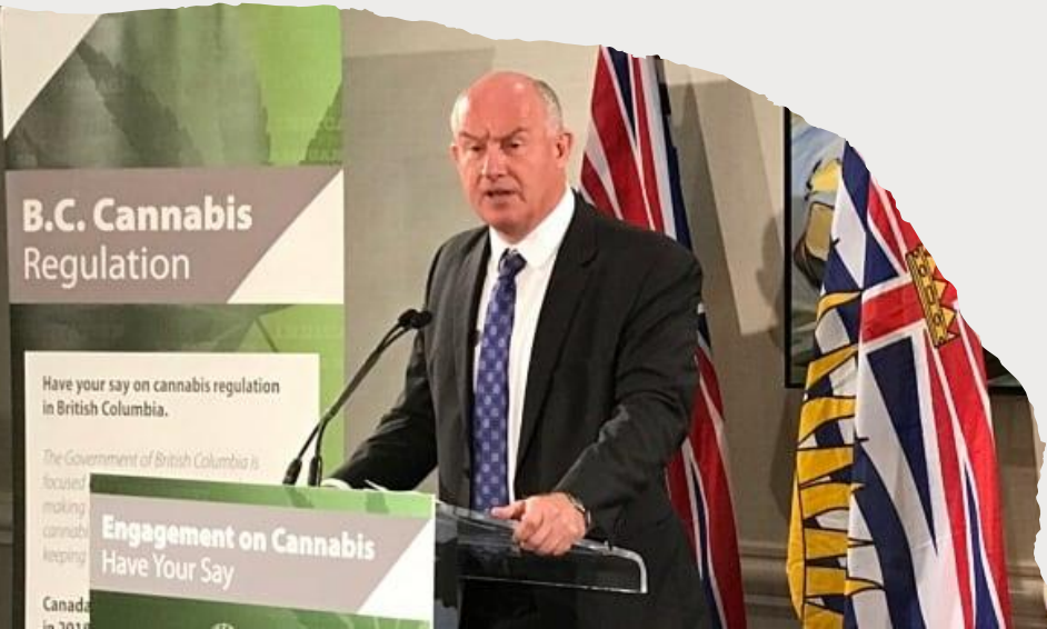
Image: Minister Mike Farnworth who previously oversaw public safety and cannabis; Honorable Garry Begg is current Minister of Public Safety and Solicitor General