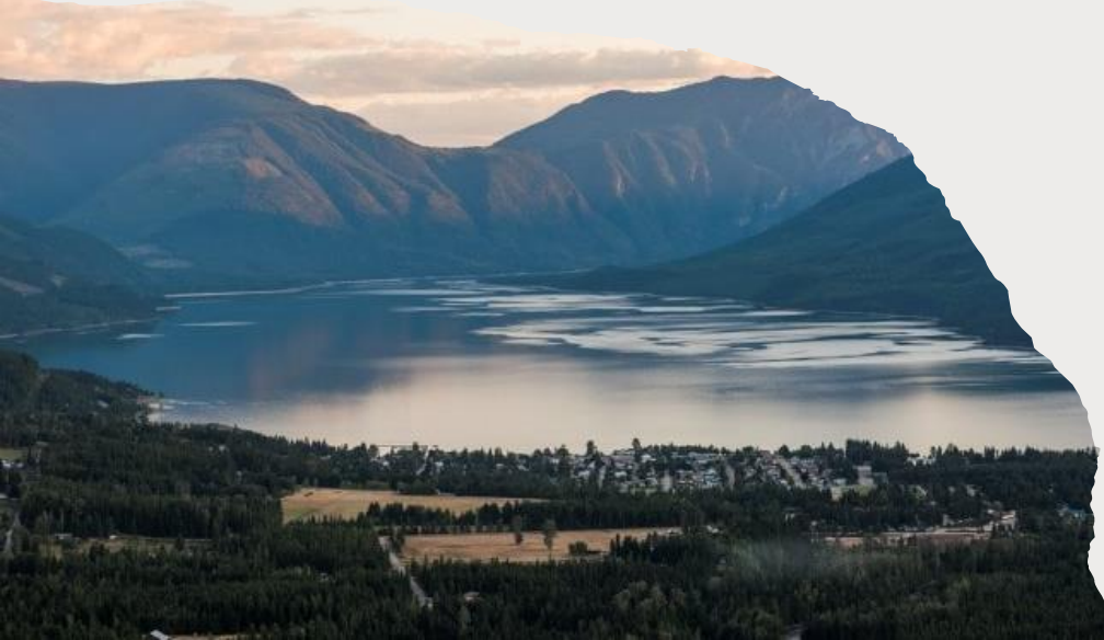
Image: Slocan Lake, Kootenay Region