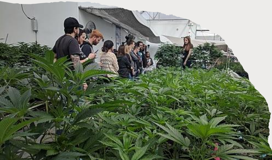
Image: Cannabis tourism tour in Denver