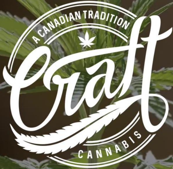
Image: Craft Cannabis Association of BC (CCABC) – a province wide non-profit industry association