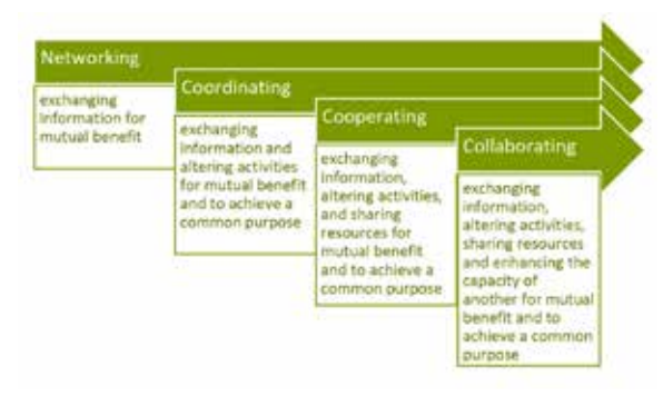
Figure 2. Collaboration continuum.

to share. Each level can be appropriate depending on the context, and organizations should ask themselves what makes the most sense given the needs and objectives.